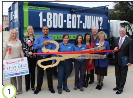
1 1-800-GOT-JUNK? www.1800gotjunk.com

1-800-GOT-JUNK? offers full-service junk removal for your home or business including offices, retail locations, construction sites, and more. Our friendly team is happy to meet all your junk hauling needs.